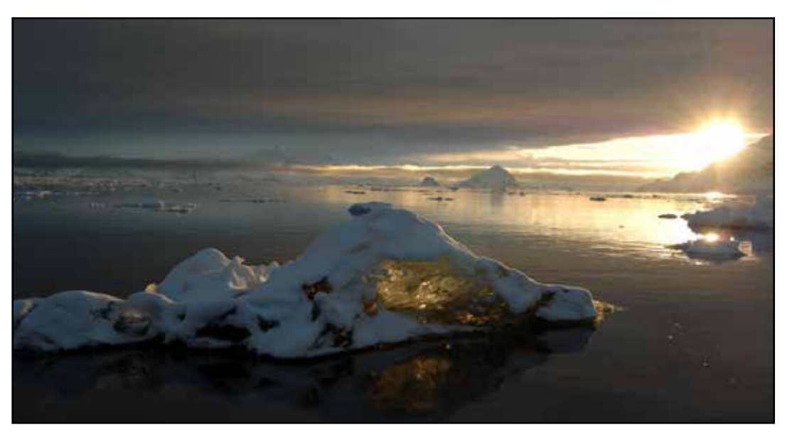
All photos in this article were taken in Wilhelmina Bay, Antarctica by Ari Friedlaender under NMFS permit 14907.