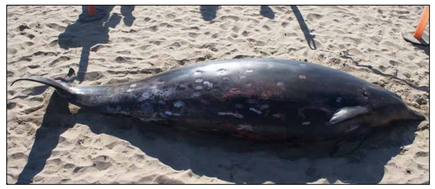
Adult female Perrin's beaked whale: Venice Beach, CA. Many cookie-cutter shark bite scars adorn her body.