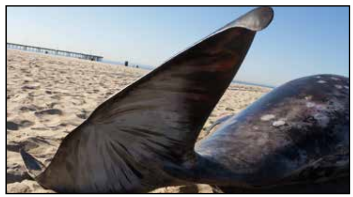
Fluke: the ventral side of her fluke displays the extremely distinctive starburst pigment pattern that is only known in Perrin's and Stejneger's beaked whales.

Early the next morning, Dave headed to the NHM to pick up the "Whale Truck," a Ford 4-wheel-drive tilt-bed that was specially modified to pick up and transport whales and dolphins; it has a heavy-duty winch strong enough to pull the beaked whale off of the beach. I headed directly to Venice Beach - determined to make sure that no one had taken the whale away for disposal, and to obtain as many images as possible before the whale's natural coloration faded in the sun. When I arrived, I saw that the lifeguards had moved the whale to their parking lot, away from the water, and had covered it with a tarp. I lifted the tarp and saw that the whale's carcass was in excellent condition much better than we typically encounter! I could see that it was a female; as expected, she did not have erupted teeth, so it would be very difficult to identify the species. I took lots of photos from every angle, and asked the lifeguards for a ladder to get other perspectives. Like many beaked whales, this one was covered in variously pigmented oval-shaped scars, caused by sneak attacks by cookie-cutter sharks; this small bioluminescent shark charges up to the whale and clamps its circular jaws down on the whale