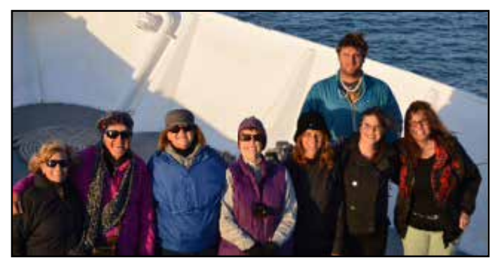
Whalewatching fun with the San Diego chapter.

Make sure to "Like" us on Facebook: www.facebook.com/ACSpugetsound