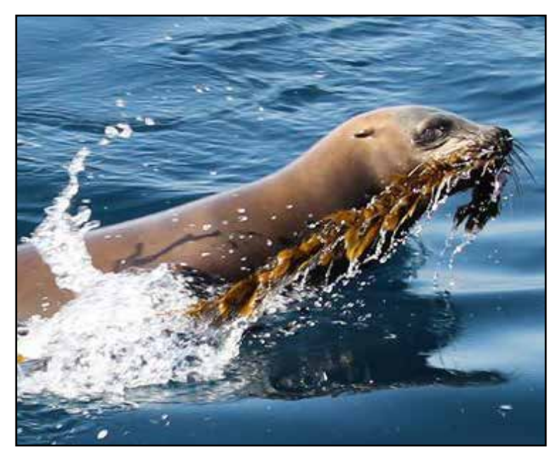
NOTHIN' LIKE A NICE PIECE O'KELP. Cute sea lion picture, taken January 11 on a trip with Davey's Locker out of Newport Beach.

For our inspiring monthly presentations, events, SF Bay ACS Student Chapters and school projects, and updates on issues please visit our website: www.acs-sfbay.org and be sure to follow us on Facebook at facebook.com/sfacs .